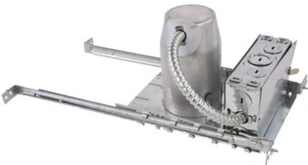
Shown in: Galvanized Steel

R3-GUICAT LED 3 Inch IC AirTight New Construction Housing is designed to be installed in line voltage new construction applications. IC rated housing may have direct contact with insulation. Accommodates up to a 10 watt, 120 volt GU10 MR16 LED or 50 watt, 120 volt GU10 MR16 halogen bulb, sold separately. Note: A complete fixture requires a housing and trim, sold separately. Note: Housing is Non-IC when using a halogen bulb.