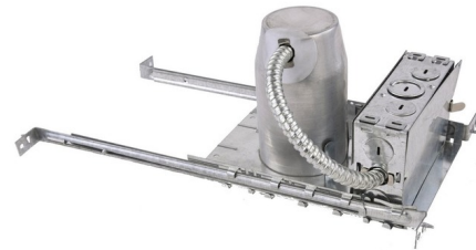
Shown in galvanized steel