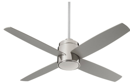
Shown in polished nickel