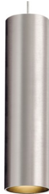
Shown in: Satin Nickel / Satin Nickel

Piper Freejack Pendant features a sleek cylinder shaped metal shade providing crisp downlight. Compatible for use with 1-circuit Monorail track system or Freejack canopy. Available with halogen and LED lamp options. Supplied with six feet of field-cutttable suspension cable and a Freejack connector. Freejack canopy required if used as a monopoint, sold separately. LED canopy compatible with both halogen and LED lamp options. Dimmer type dependent on system transformer (low voltage magnetic or electronic).