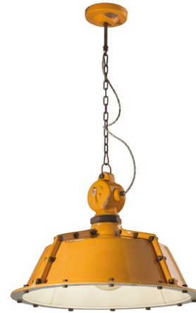
Shown in vintage yellow