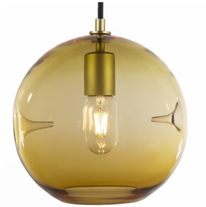
Shown in: Satin Brass / Topaz

The Poke Pendant is a hand crafted blown glass piece that is made from partially recycled glass with love and attention to every detail. This fixture would stand perfectly solo but make your individual statement by hanging in multiples. The beautiful glass is available in Amethyst, Aquamarine, Citrine, Opal, Slate or Topaz with an Onyx cord and Blackened Brass or Satin Brass finish. Made in the USA. UL Listed.