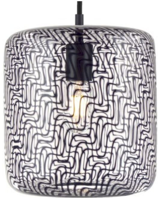
Shown in: Onyx Cord / Blackened Brass Finish / Charcoal

The Cane Charcoal Drift Drum Pendant is a hand crafted blown glass piece that is made from partially recycled glass with love and attention to every detail. This fixture would stand perfectly solo but make your individual statement by hanging in multiples. Featuring a drifted line pattern of Charcoal rotating around the drum shaped shade with cord and metal in the following combinations: Onyx/Blackened Brass, Onyx/Satin Brass, Gold/Satin Brass or Fuchsia/Blackened Brass. Made in the USA. UL Listed.