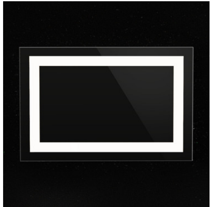
Shown in: Mirror

The Classic L01D Horizontal Full Frame Inset Direct LED Mirror perfectly blends functionality and style, providing the right amount of direct illumination for your daily grooming routine while its sleek, modern design elevates your bathroom or vanity area. High-quality materials, craftsmanship, and energy-efficient LED lighting ensure that it lasts a long time. Notes: The mirror must be installed horizontally. A vertical version is sold separately.. The mirror is available with or without an anti-fog demister that defogs the center area of the mirror. The anti-fog demister voltage is 120V and it must be on an independent switch, or can be on the same switch as the mirror if it is 120V non-dimming.