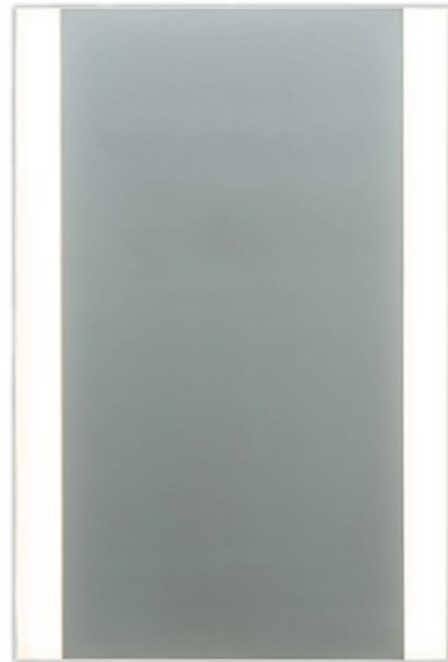
Shown in: Anodized Aluminum

The L2 Two-Side Edge Lighted Vanity mirror offers a sleek, modern look available in a variety of sizes and color temperatures featuring two Frosted glass panel diffuser bordering the long edges of the mirror to provide direct and indirect light. Three sizes available with a choice of 3000K or 4000K temperature. Standard light output with 4W per foot. Optional Anti-Fog Demister heating pad available. May be mounted vertically or horizontally. Suitable for damp locations. CSA listed. ADA compliant.