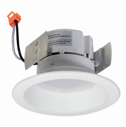
Shown in white reflector / white flange