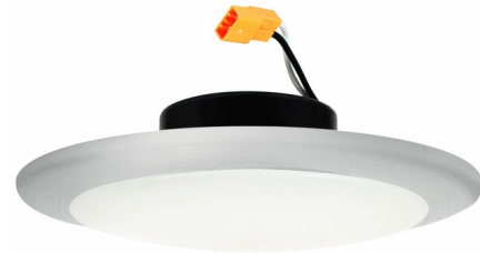
Shown in natural metal / white

COLOR RENDERING . . . . . 90 CRI LAMP COLOR . . . . . 4000K LUMENS/WATT . . . . . 66.67 LUMINOUS FLUX . . . . . 700 lumens