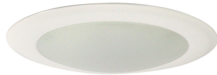
Shown in white / white