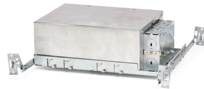
Shown in aluminum

APERTURE SIZE . . . . . 2.000" HOUSING HEIGHT . . . . . 4" HOUSING TYPE . . . . . New construction IC Airtight LUMENS/WATT . . . . . 71.43 LUMINOUS FLUX . . . . . 1000 lumens