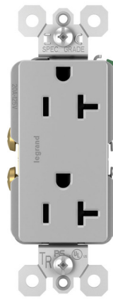
Shown in grey

Radiant 15 Amp or 20 Amp Tamper Resistant Receptacle is a step up from the standard with simple, classic options in wiring devices, home automation controls and screwless wall plates that complement today's homes. Meets National Electrical Code Tamper-Resistant requirements. Protects children: patented shutter system helps prevent improper insertion of foreign objects now with black invis-shutters for an invisible effect preferred by end users. High-impact resistant thermoplastic construction. Low profile face. Note: Radiant Screwless wall plates are sold separately.