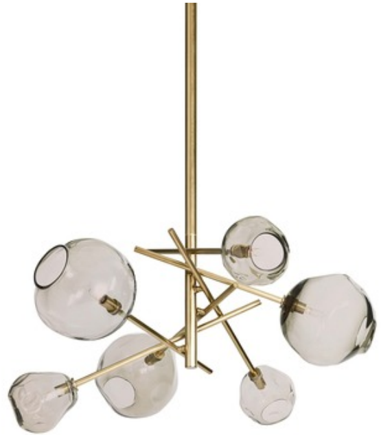
Shown in: Natural Brass / Smoke

The Molten Chandelier is an eye catching organic form that is suspended from metal adjustable rods. The molten glass has an inherent beauty of variation in texture and size in this stunning modern piece. Available with Smoke glass/Natural Brass or Clear glass/Polished Nickel. CSA and UL listed.