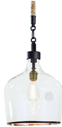
Shown in blackened steel / clear

The Demi John Pendant features a Clear subtly textured glass shade that hangs from Blackened Steel and twisted jute rope to illuminate & add refreshing character over an island, sink or dining table. Available in two sizes. CSA and UL listed.