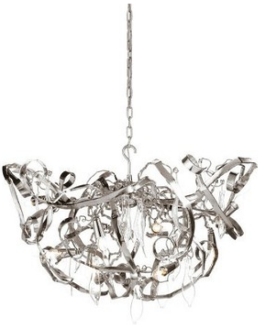
Shown in: Nickel / Clear

The Delphinium Round Chandelier features a diffuser of hand-sculpted metal full of gaiety and elegance. Large, clear glass elements drop down throughout the garland of iron completing this sculptural masterpiece. Includes a 6.29 inch ceiling cover plate. NOTE - All sizes require a special rated junction box for fixtures weighing over 50 pounds.