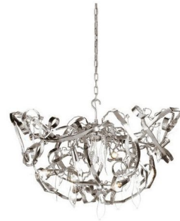
Shown in nickel / clear

PRODUCT DIMENSIONS . . . . . Adjustable Chain Length: 66.9"