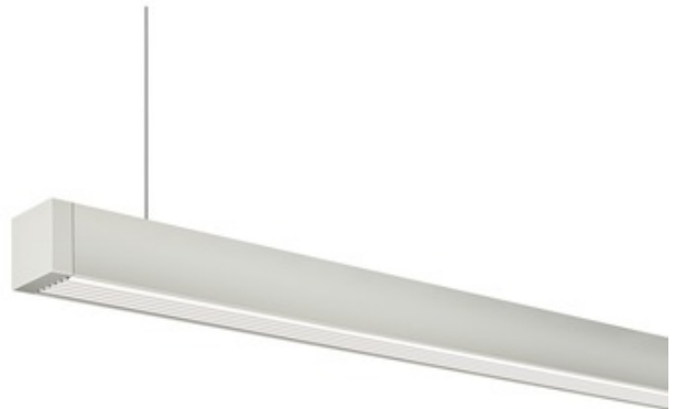
Shown in: Satin Aluminum / White Lens

Cirrus Suspension Wall Wash with Left Feed is a linear LED fixture that features a wall wash lens for a smooth and uniform beam spread. Available in various increments from 36 to 288 inches, a variety of finish options, two wattage options, and a spectrum of color temperature options. Chrome finish available up to 84 inch length. Product is built to order. Note: Canopy mounts to a standard junction box either using the PS-60L-ELV-24VDC (60 Watt 24 Volt DC Power Supply) which fits inside junction box, or from a 24VDC remote Universal (UNI) power supply. Universal dimming with UNI power supply (TRIAC/ELV/0-10V). ELV dimming with PS-60L-ELV power supply. Power supply, dimmer control, and optional accessories sold separately. Note: Includes a 4 inch round canopy and adjustable 12 foot coaxial and aircraft cables. Additional aircraft cables are included for support when fixture exceeds 72 inches. Power feeds at left (when viewing wall to be washed) or you may adjust to center within 5 feet of either end.