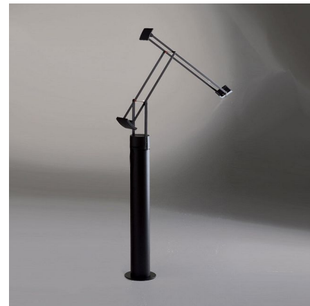
Shown in black / black

Tizio 35 Floor Lamp features a floor support in lacquered steel with snap in adapter kit in molded thermoplastic. Incorporated low voltage transformer and two intensity on/off switch. Fully adjustable arms in anti corrosion treated aluminum. Arm spacer bars in chromed steel with red, molded thermoplastic insulators and counterweights in zinc alloy. Adjustable diffuser in die-cast aluminum with inner high efficiency reflector in anodized aluminum with UV protective glass. 360 degree rotatable base. Finish for lamp with floor support available in Black only. Floor support is 27 9/16 inches high x 3 15/16 inch diameter. Tizio 35 lamp is 22 inches high x 25 5/8 inches deep x 39.25 inch maximum arm extension. Includes one 35 watt GY6.35 halogen lamp. UL listed.