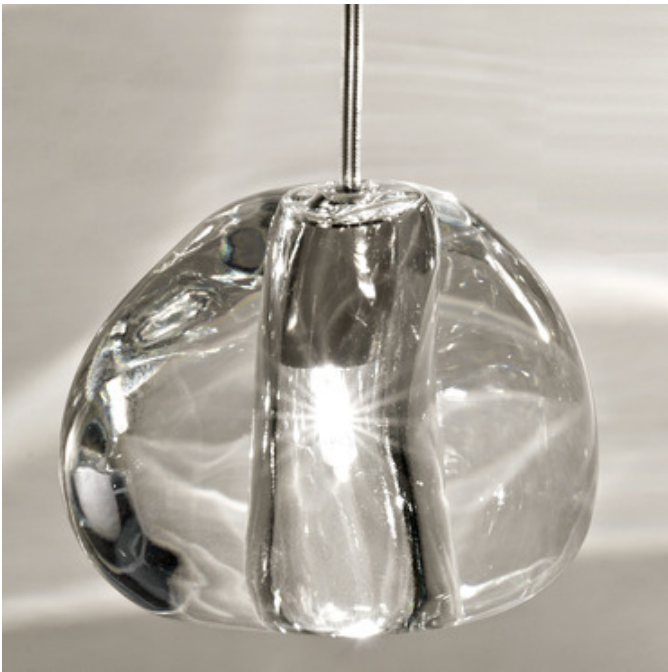
Shown in: Brushed Nickel / Clear

DESCRIPTION The Mizu pendant, designed by Nicolas Terzani, is a hand-made artistic light inspired by tranquil and mesmerizing light refractions created by water. Like water droplets, no two Mizu fixtures are alike. Each crystal shape is unique. Mizu is made from 24 percent lead, the clearest crystal, and perfectly emulates water's refraction of light creating amazing patterns around a room.