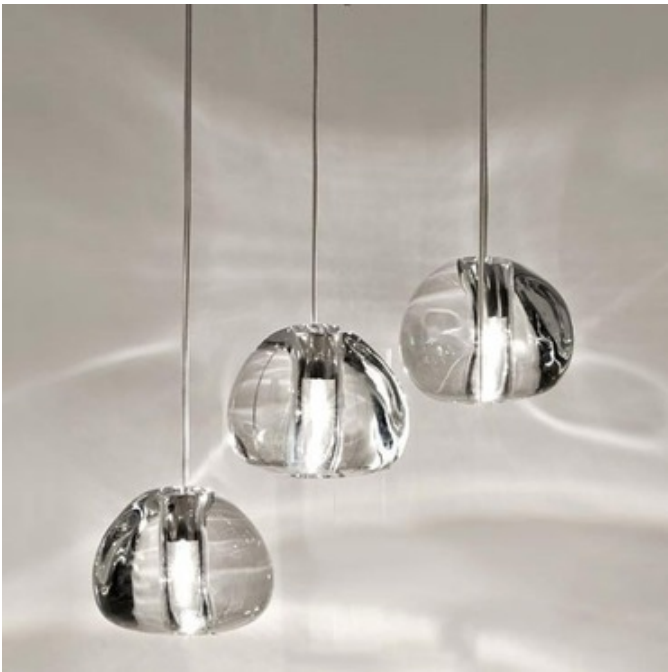
Shown in: Brushed Nickel / Clear / Brushed Nickel

The Mizu Round Multi Light Pendant is hand-made and inspired by tranquil and mesmerizing light refractions created by water. Like water droplets, no two Mizu fixtures are alike. Each crystal shape is unique. Made from 24 percent lead, the clearest crystal perfectly emulating water's refraction of light. Available with 3, 7, 15 or 26 pendants. Note: Not all options available.