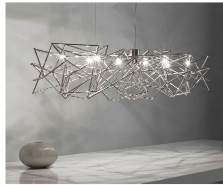
Shown in nickel

Etoile linear suspension in nickel finish is a celestial fixture made of interwoven shafts that glitter from all directions. Designed by Christian Lava. Its intricate network of intersecting nickel lines recalls constellations in a clear sky. Strategically placed bulbs cast a starry light, twinkling as viewers move around the pendant. Requires eight 20 watt 12 volt, JC, G4 bi-pin xenon lamps, not included. General light distribution. ETL listed. Overall height is 39.4 inches, adjustable at installation. 51.2 inch width x 7.9 inch height.