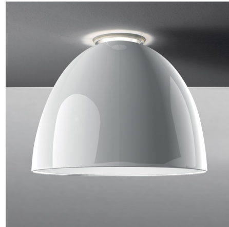
Shown in gloss white