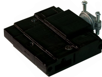
Shown in black

The Undercabinet Splice Box is required for hardwire applications. Conduit is fed into the back and jumper connector ports on each side can feed power to undercabinet light runs in two directions. The 1 inch jumper connector (sold separately) can be used to place the splice box next to the undercabinet housing. Longer jumper connectors can be used to place the splice box in a more convenient or remote location. Includes 3/8 inch conduit connector. Designed for use with Tech Lighting Unilume Slimline and Glyde undercabinet lights.