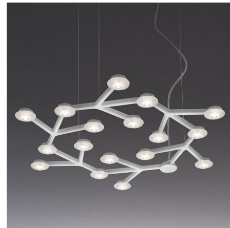
Shown in white

PRODUCT DIMENSIONS . . . . . Canopy: 10" diameter LAMP LIFE . . . . . 50000 hours COLOR RENDERING . . . . . 80 CRI LAMP COLOR . . . . . 3000K LUMENS/WATT . . . . . 62.77 LUMINOUS FLUX . . . . . 1883 lumens