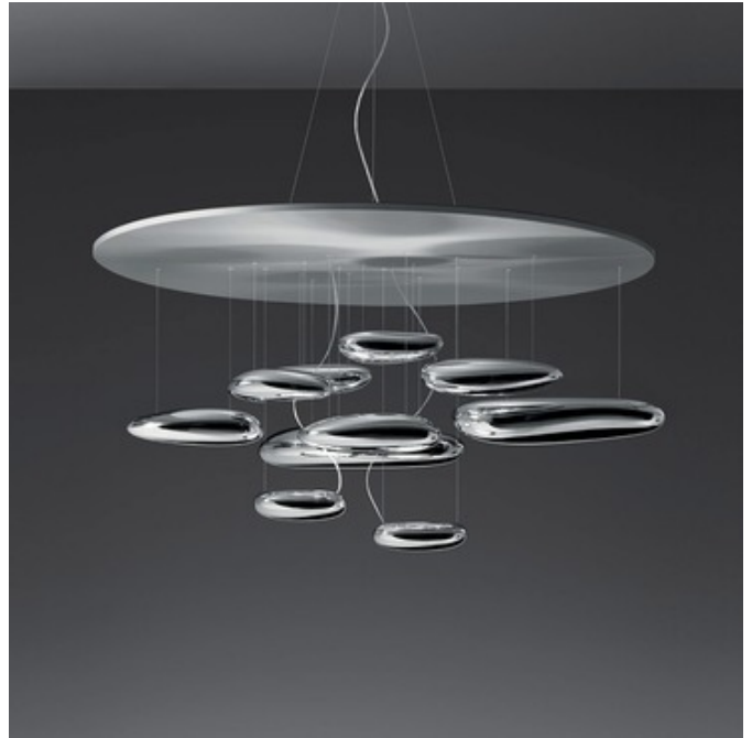
Shown in: Polished Aluminum / Stainless Steel

The Mercury Suspension features a die-cast aluminum body with a reflective unit made of injection-molded thermoplastic material with a metallic finish and stainless steel reflector.