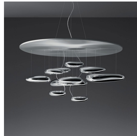
Shown in polished aluminum / stainless steel

LAMP LIFE . . . . . 50000 hours COLOR RENDERING . . . . . 93 CRI LAMP COLOR . . . . . 3000K LUMENS/WATT . . . . . 46.41 LUMINOUS FLUX . . . . . 2692 lumens