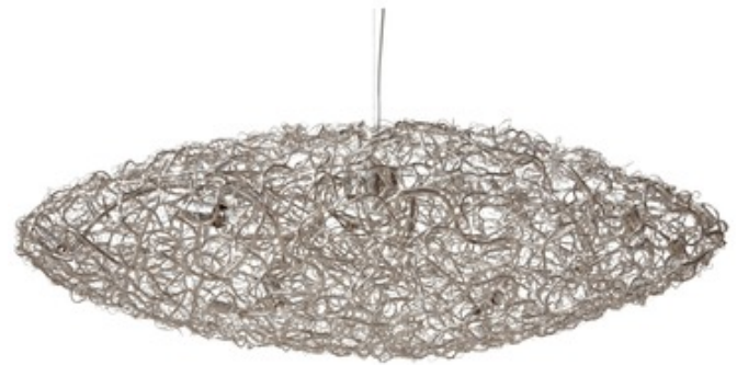
Shown in: Nickel

The Crystal Waters Cigar Linear Pendant features a hand sculpted frame of nickel strands in a wide range of shapes that flow like the water leaving a riverbed. Includes a 6.29 inch ceiling cover plate.