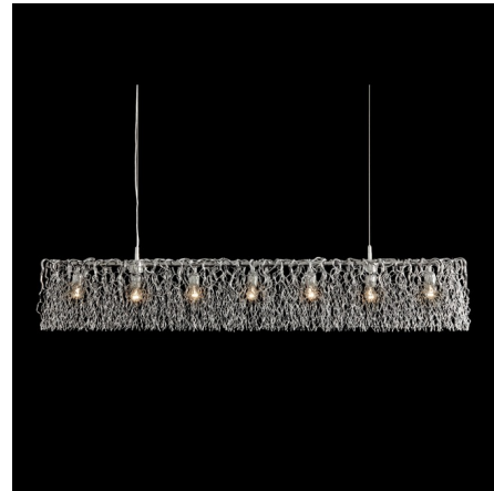
Shown in nickel

The Hollywood Long Hanging Lamp features sculpted metal in an organic design, evocative of bare branched trees. Light reflects off the sinewy branches of this sculptural masterpiece. Each fixture is a unique, hand crafted piece, and comes with a certificate of authenticity. NOTE - Largest size requires a special rated junction box for fixtures weighing over 50 pounds. Includes canopy cover for US junction box.