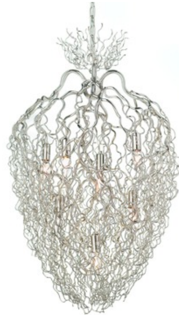
Shown in: Nickel

The Hollywood Conical Chandelier features sculpted metal in an organic design, evocative of bare branched trees. Light reflects off the sinewy branches of this sculptural masterpiece. Each fixture is a unique, hand crafted piece, and comes with a certificate of authenticity. NOTE - Large version requires a special rated junction box for fixtures weighing over 50 pounds.