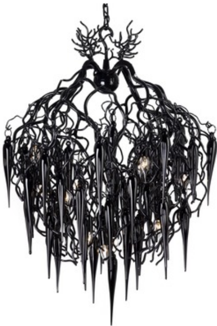
Shown in: Matte Black

The Hollywood Round Glass Chandelier features sculpted metal in an organic design, evocative of bare branched trees. Light reflects off the sinewy branches of this sculptural masterpiece Each fixture is a unique, hand crafted piece, and comes with a certificate of authenticity. NOTE - Medium, Large and Extra Large sizes requires a special rated junction box for fixtures weighing over 50 pounds.