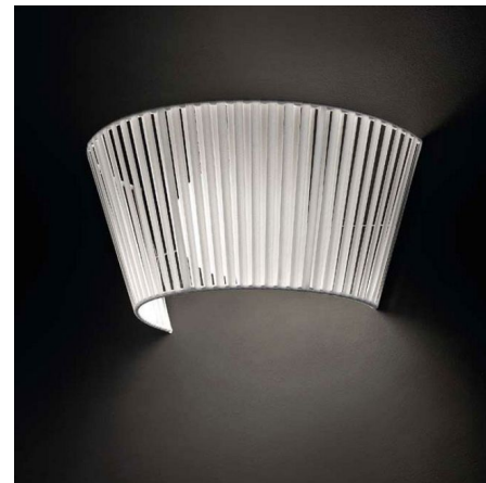
Shown in satin nickel / white

Ribbon Wall Light features silky cloth tape wrapped by hand around a metal structure, creating a unique visual effect thanks to the use of a blown glass diffuser that appears and disappears visually turning around the lamp shade. Shade available in Black, Mocha, White or Ivory with finish in Satin Nickel. One 40 watt, 120 volt JCD G9 halogen bulb is required, but not included. 14.8 inch width x 7.5 inch height x 9 inch depth.