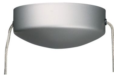
Shown in satin nickel