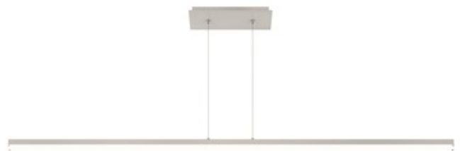
Shown in: Satin Nickel / White Lens

The Cirrus Power T1 Lens Suspension with Center Feed is a linear LED fixture that offers direct light in a clean, contemporary style. Available in various increments from 36 to 120 inches with a 176 degree white diffused tubular lens, a variety of finishes, four wattage options, and a spectrum of color temperature options. Chrome finish available up to 84 inch length. Satin Black and Antique Bronze finishes feature Antique Bronze hardware. All other finishes feature Satin Nickel hardware. Includes a linear canopy with a 120V/24VDC Universal LED power supply, and 12 foot adjustable coaxial cables. A support cable will be added on each end when fixture is over 72 inches in length. Dimmable with an electronic low voltage (ELV), Triac (magnetic), or 0-10V dimmer, sold separately. ETL listed. Fixture includes a 5 year warranty. Product is built to order.