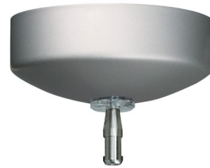
Shown in satin nickel

This Monorail 60 Watt LED Single Feed Electronic Surface Mount Transformer converts standard 120 line-voltage to 12 volts to provide the necessary voltage for powering a Monorail low-voltage LED lighting system. It can power lamps totaling up to 60 watts. Finish available in Satin Nickel or Antique Bronze. The transformer is concealed inside a decorative housing with a fast acting secondary circuit breaker that will safely turn the system off should a short occur. Once the short has been removed the unit can be reset by simply flipping the wall switch off and back on. The shortest rigid standoff that can be used with this transformer is the 3 inch rigid standoff, sold separately. If dropping the rail more than 3 inches below the ceiling, order the desired rigid standoff length and one compatible power extender, sold separately. ETL listed. 5.1 inch diameter x 3.5 inch height.