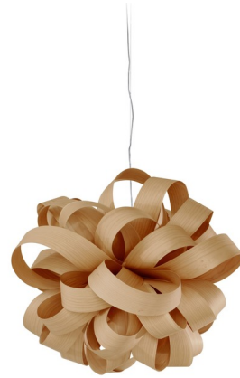
Shown in matte nickel / natural beech

The Agatha Ball Pendant has an arresting and dramatic demeanor, making this fixture sculptural, physical and versatile. Agatha fills the room with her ambient glow and appealing body. The elegant interlacing whorls of handmade wood veneer strips spring concentrically from its center, their mass blossoming and flourishing. Supplied with 8 foot steel cable and transparent electrical cord. Includes mounting plate to cover standard US junction box. Dimmable with a Triac dimmer.