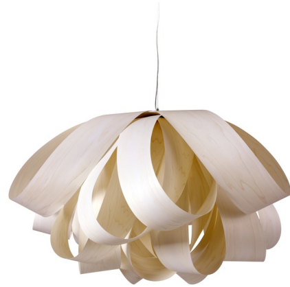
Shown in brushed nickel / ivory white

The Agatha Pendant, designed by Luis Eslava, has an arresting and dramatic demeanor making this sculptural, physical and versatile. Agatha fills the room with her ambient glow and appealing body. The elegant interlacing whorls of handmade wood veneer strips spring concentrically from its center, their mass blossoming and flourishing. Available in a variety of colors with Brushed Nickel canopy finish. Supplied with 8 foot suspension steel cable and transparent electrical cord. Integrated LED module option dimmable with a Triac or 0-10V dimmer.