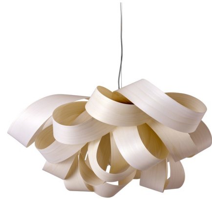
Shown in brushed nickel / ivory white

The Agatha Pendant, designed by Luis Eslava, has an arresting and dramatic demeanor making this sculptural, physical and versatile. Agatha fills the room with her ambient glow and appealing body. The elegant interlacing whorls of handmade wood veneer strips spring concentrically from its center, their mass blossoming and flourishing. Available in a variety of colors with Brushed Nickel canopy finish. Supplied with 8 foot suspension steel cable and transparent electrical cord. Integrated LED module option dimmable with a Triac or 0-10V dimmer.