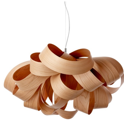
Shown in brushed nickel / natural cherry

The Agatha Pendant, designed by Luis Eslava, has an arresting and dramatic demeanor making this sculptural, physical and versatile. Agatha fills the room with her ambient glow and appealing body. The elegant interlacing whorls of handmade wood veneer strips spring concentrically from its center, their mass blossoming and flourishing. Available in a variety of colors with Brushed Nickel canopy finish. Supplied with 8 foot suspension steel cable and transparent electrical cord. Integrated LED module option dimmable with a Triac or 0-10V dimmer.