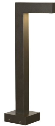
Shown in bronze