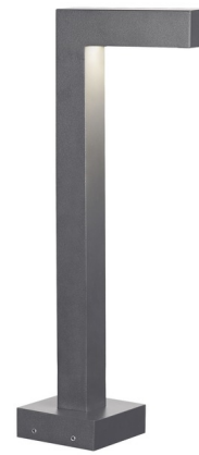
Shown in charcoal