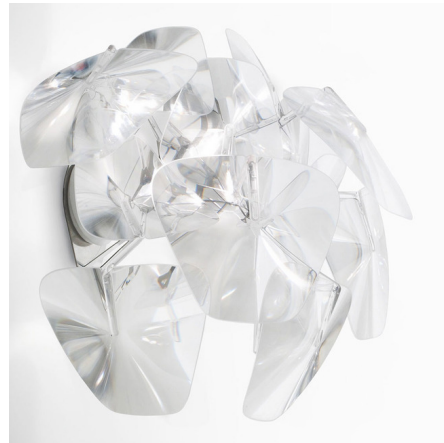
Shown in polished stainless steel / transparent

Hope Wall Sconce features a structure in polished stainless steel and transparent polycarbonate shade. A series of thin polycarbonate Fresnel lenses, created using imprinted micropisms on polycarbonate film, to achieve a dioptric effect similar to glass.