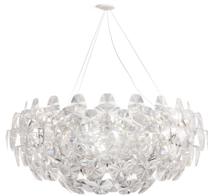
Shown in polished stainless steel / transparent