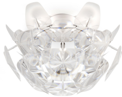
Shown in polished stainless steel / transparent

Hope Ceiling Light features a structure in polished stainless steel with transparent polycarbonate arms and prismatic lenses. The lenses achieve a dioptic effect similar to glass. Available in two sizes.