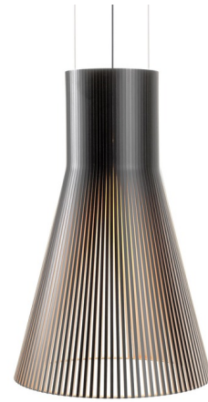
Shown in black / black laminated birch

The Magnum 4202 Pendant features a shade made from laminated birch slats available in Natural Birch, White Laminated Birch, Black Laminated Birch or Walnut Birch. Crafted in Finland. ETL listed.