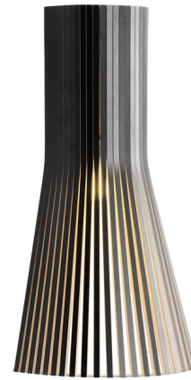
Shown in black laminated birch

Secto 4231 Wall features a shade made from laminated birch slats available in Natural Birch, White Laminated Birch, Black Laminated Birch or Walnut Birch. Fixture can be mounted so that the light streams upward or downward. ETL listed.