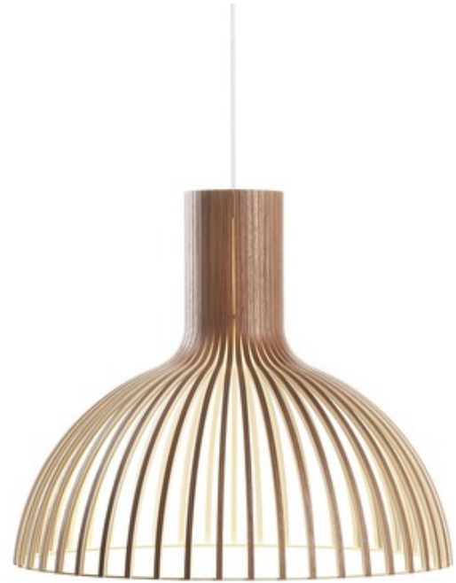
Shown in: White / Walnut Birch

The Victo Pendant features a shade made from laminated birch slats connected by rings of aircraft plywood.