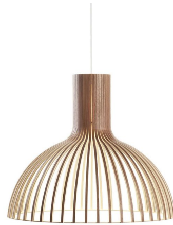
Shown in white / walnut birch

The Victo Pendant features a shade made from laminated birch slats connected by rings of aircraft plywood.