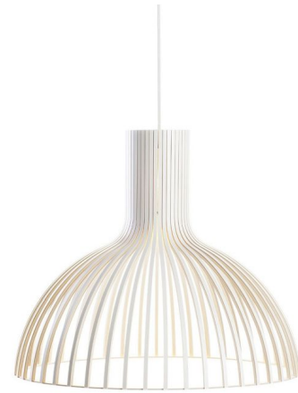
Shown in white / white laminated birch

The Victo Pendant features a shade made from laminated birch slats connected by rings of aircraft plywood.