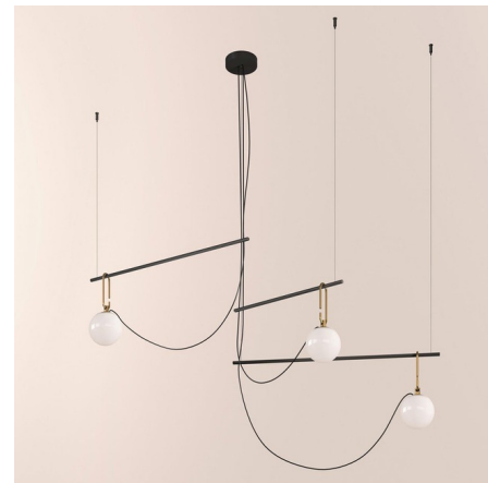
Shown in brushed brass / white

PRODUCT DIMENSIONS . . . . . Canopy: 5.4" diameter