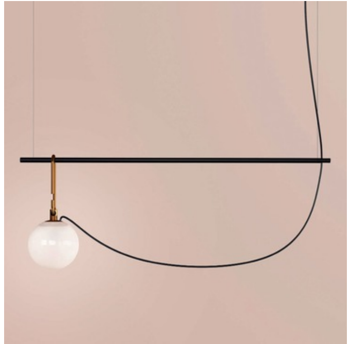
Shown in: Brushed Brass / White

Designed by Neri & Hu, the NH Suspension features a White Blown glass sphere on a Brushed Brass ringhanging from a slender black arm. The materials are a perfect combination of tradition and innovation, as well as an expression of responsible and sustainable design conveyed by the use of a low-consumption retrofit LED light source and the eco-friendly cardboard packaging.