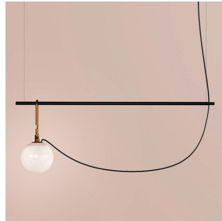
Shown in brushed brass / white