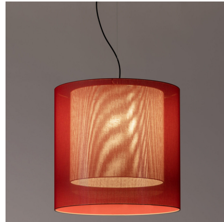
Shown in black / red / white

The Moare Pendant takes its name from the Moire effect, an asymmetrical optical illusion of water, produced by its superimposed textures against the light. Each pendant includes three concentric shades - an inner White methacrylate cylindrical diffuser paired with different sized middle and outer polyester shades in any combination of Grey, Black, Red, and White.