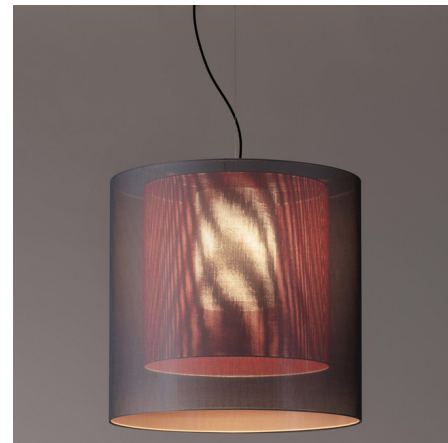
Shown in black / grey / red

The Moare Pendant takes its name from the Moire effect, an asymmetrical optical illusion of water, produced by its superimposed textures against the light. Each pendant includes three concentric shades - an inner White methacrylate cylindrical diffuser paired with different sized middle and outer polyester shades in any combination of Grey, Black, Red, and White.